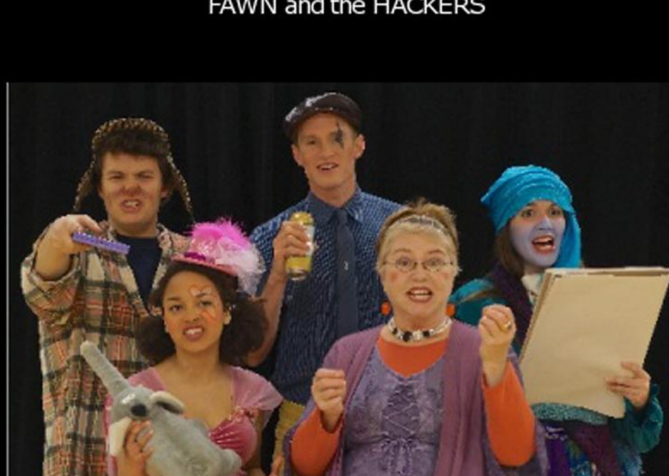
The HACKERS stage a musical number called GIMME.