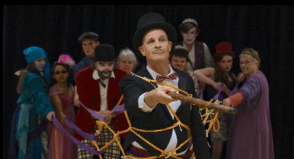
BONES leads the HACKERS on a search for Elephant

All seats are affordably priced at only $17! Visit our website at www.snowlionrep.org for information and to purchase tickets.