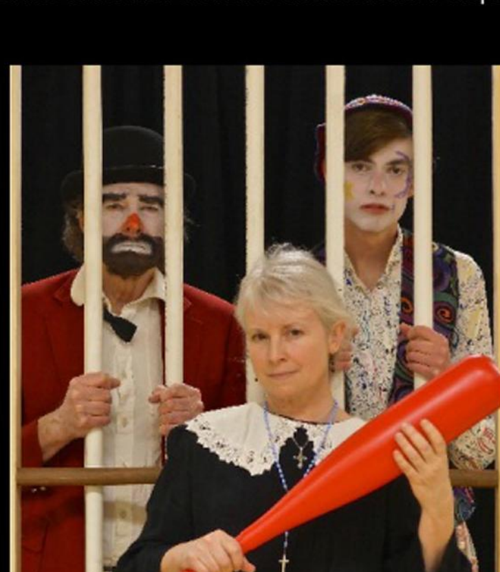
PACHY DERMAN and DARLENE are captives of FAWN and the HACKERS