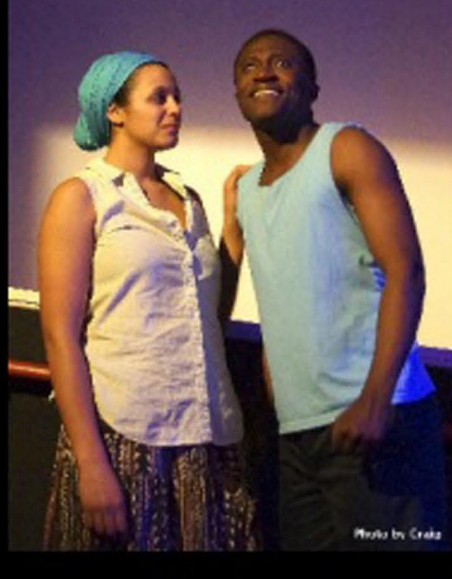
From Snowlion Rep's production of "THE MAINE DISH"

SUPPORT GREAT THEATER IN MAINE AND BEYOND!