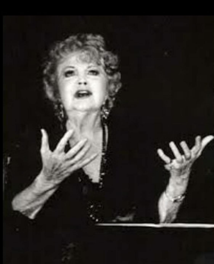
Stella Adler teaches in New York