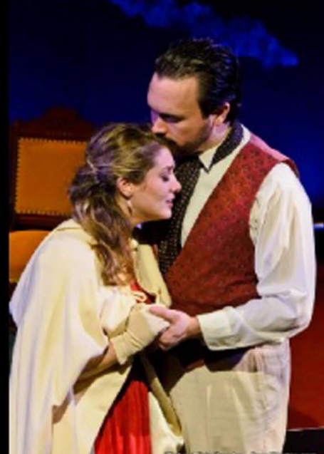
From Snowlion Rep's production of "THE CHRISTMAS BRIDE"

SUPPORT GREAT THEATER IN MAINE AND BEYOND!