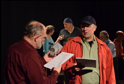
Part of the show recreates interviews of the signers by Snowlion Rep cast members