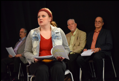
The trial to determine the constitutionality of the median strip ordinance goes forward