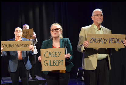
Members of the Portland community speak out about homelessness, giving, and the complexity of the issues involved