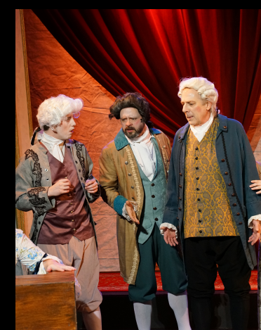
From "Mesmerized" May 2019

By supporting local theater, you help the Arts Economy thrive in Maine!