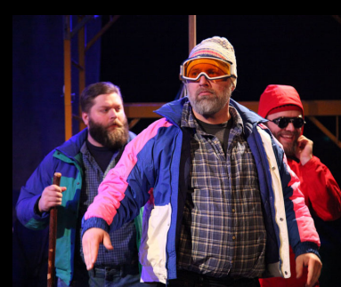
From "The Conquest of the South Pole" January 2018

By supporting local theater, you help the Arts Economy thrive in Maine!