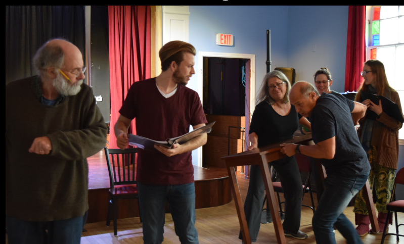
Early pioneers prepare to circle the wagons

OMNIPHOBIA explores the rocky terrain of existential anxiety and looks for hope in the midst of modern turmoil.