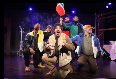
From "The Conquest of the South Pole" by Manfred Karge

By supporting local theater, you help the Arts Economy thrive in Maine!