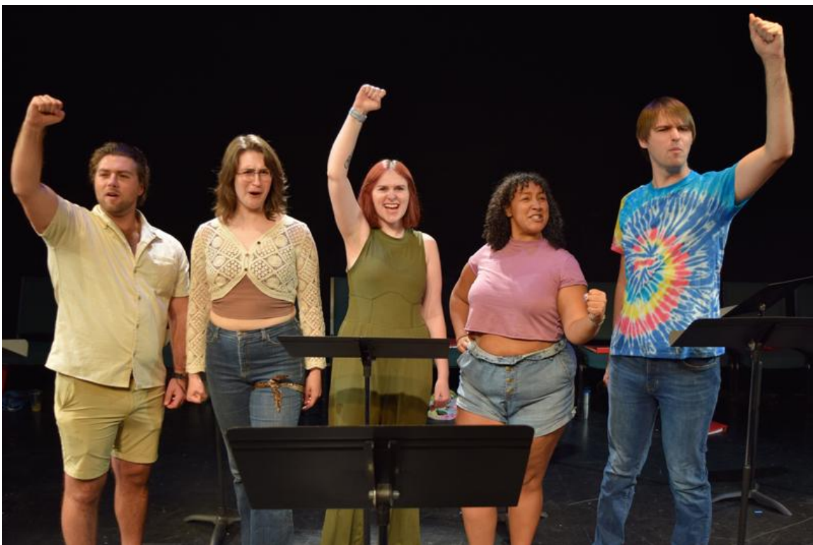
The eco-activists protest the devastation wrought by Faust Technologies