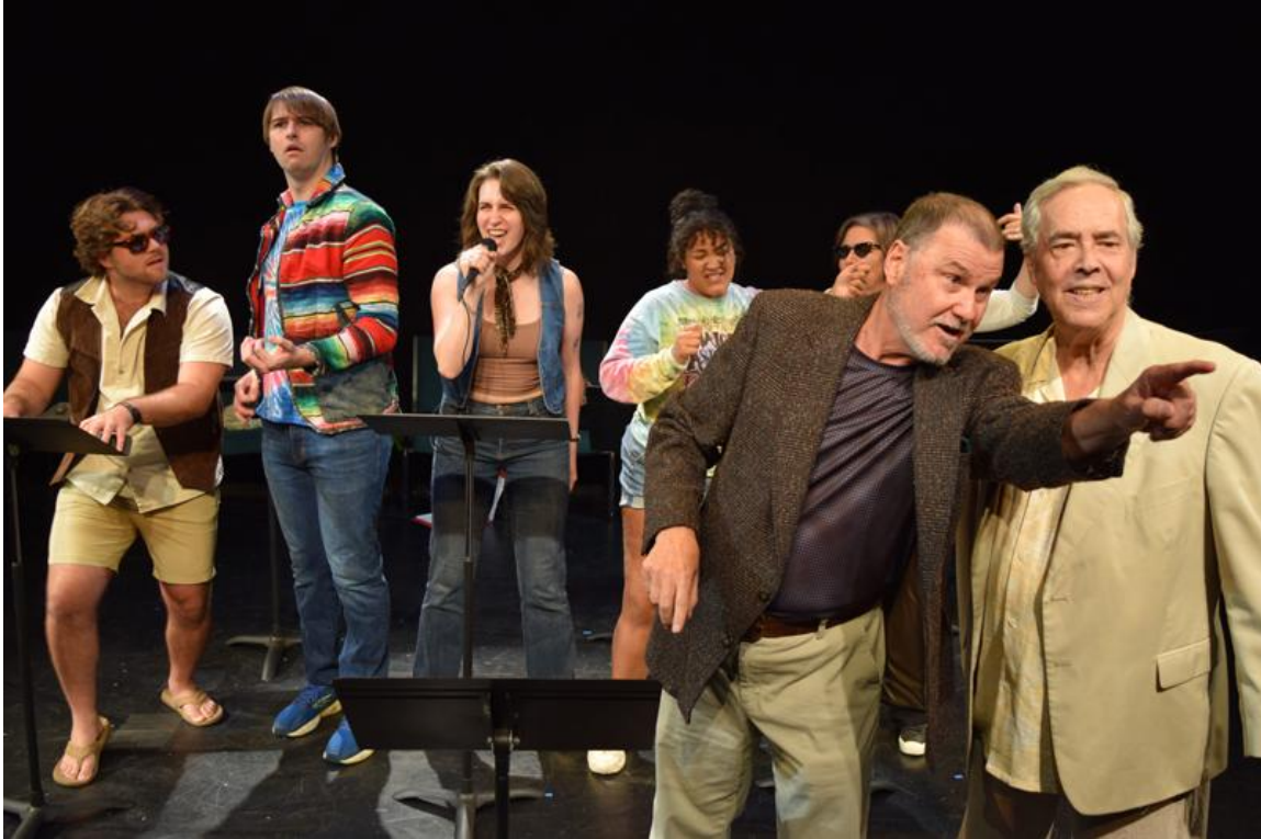
One of Faust's legendary parties includes Helen and her band A Thousand Ships