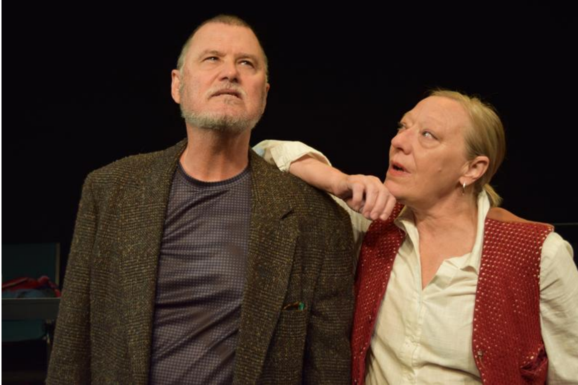
Faust is offered a tempting bargain from Mara, the embodiment of his ego