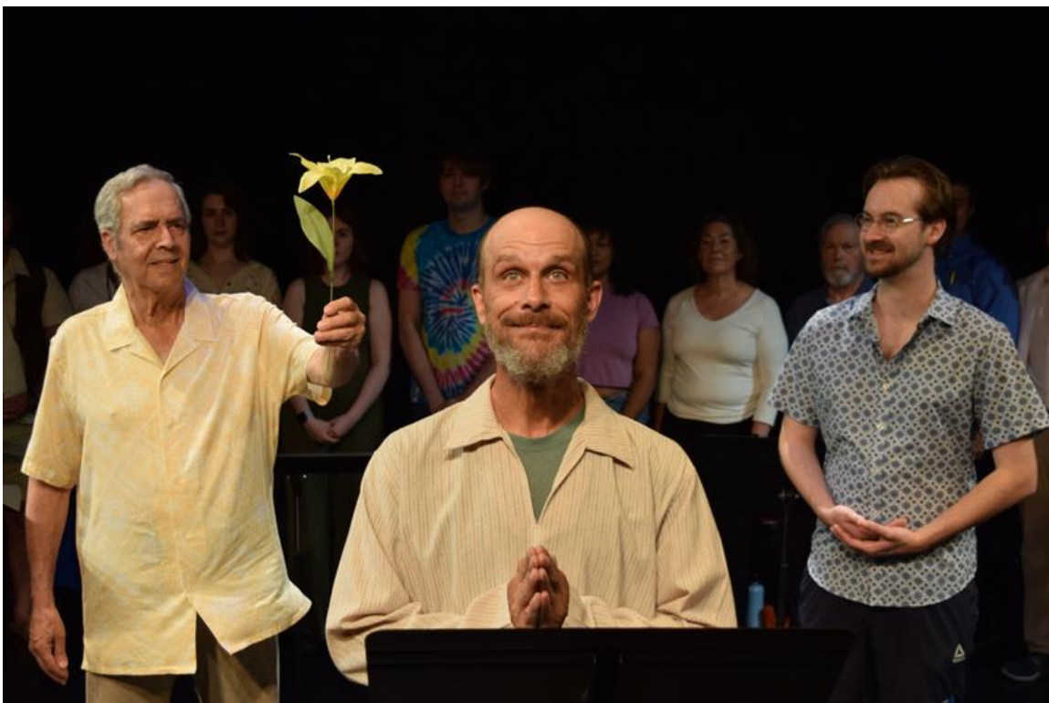
Wandering yogi Shabkar witnesses the Lotus Sutra given by the Buddha himself