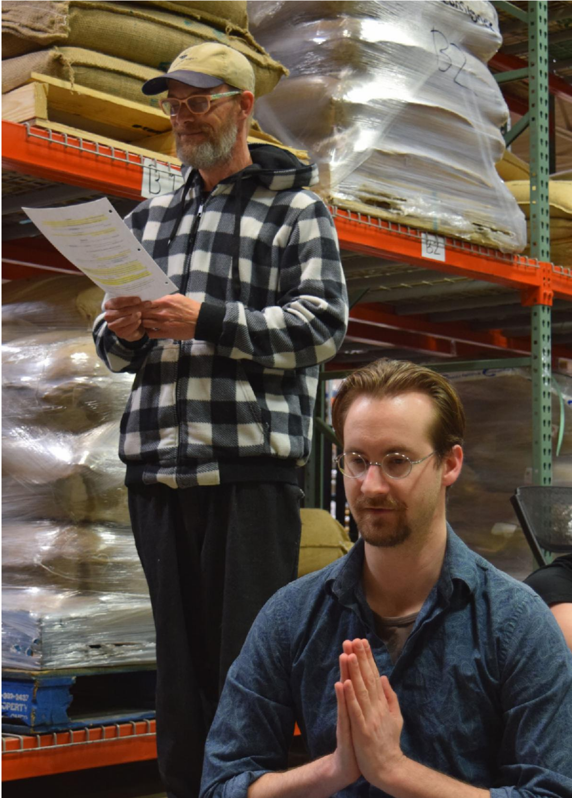
Members of the cast of Faust in the Anthropocene rehearse at the roastery in the Coffee by Design building on Diamond Street in Portland.

Oh, and just what is the Anthropocene ? Come on down to the theater to find out. Please do not miss this unique show, and help us create a community event like no other!