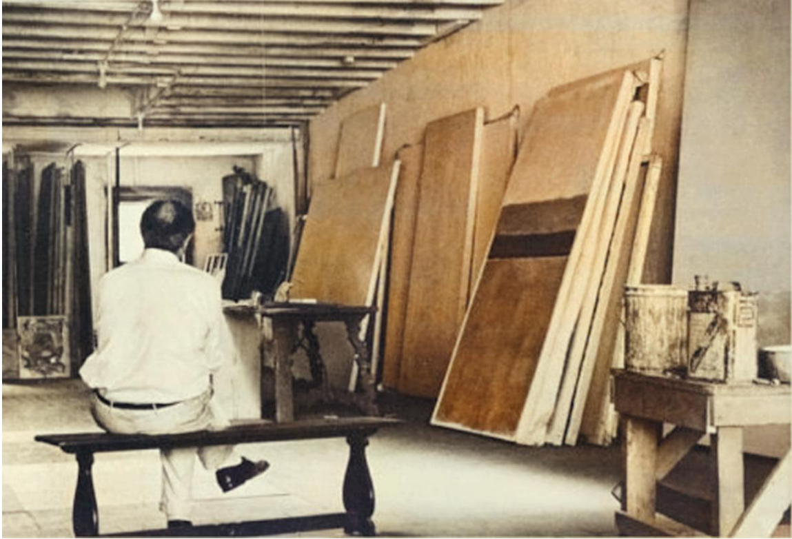
Mark Rothko in his Bowery studio, a former YMCA gymnasium, in New York

Red is the compelling account of a giant of the art world, abstract expressionist Mark Rothko, as he struggles to synthesize his growing fame with his artistic purity in this Tony Award-winning play. While matching wits with his 'modern' apprentice Ken, Rothko embarks on a spirited artistic debate on the purpose and power of contemporary art, all while the fate of his most celebrated group of paintings hangs in the balance. The play's message of embracing one's artistic passion resonates strongly with those struggling to identify their purpose and passion in life's pursuits.