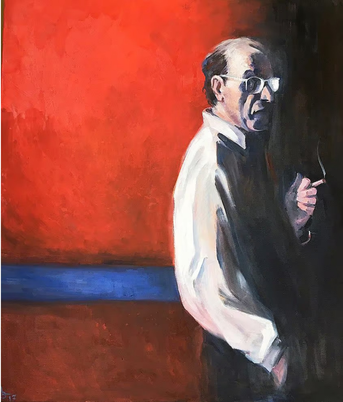
A 2017 portrait of the artist by artist Olesya Aleksandrovna Denisova

Only six performances of this remarkable and timely show. Seats are limited so get your tickets today!